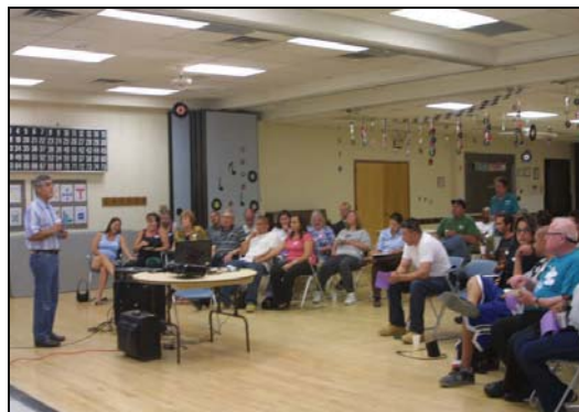
Learning about Dismas House at the North Valley Senior Center on August 26th.

We hope to have future opportunities for more community wide educational events as a collaborative program between Dismas House & Wings. Thanks to all the staff and volunteers who made this event possible.